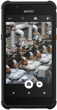
Pixavi Cam - Intrinsically Safe Camera - Silver Bundle