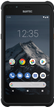
Pixavi Phone - Intrinsically Safe Smartphone - Silver Bundle