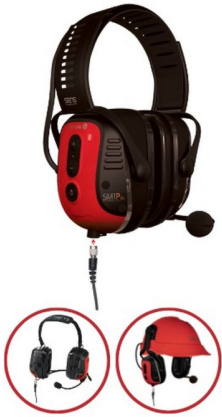
Intrinsically Safe Headset