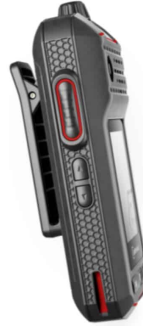
isafe mobile - 5G Radio Zone 1/21 - IS440.1