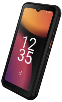
BARTEC SP9EX1 Smartphone