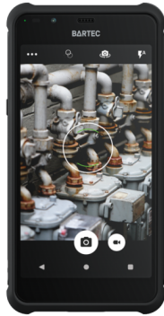
Pixavi Cam - Intrinsically Safe Camera