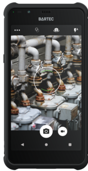
Pixavi Cam - Intrinsically Safe Camera - Silver Bundle