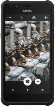
Pixavi Cam - Intrinsically Safe Camera - Silver Bundle