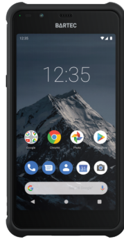
Pixavi Phone - Intrinsically Safe Smartphone - Silver Bundle